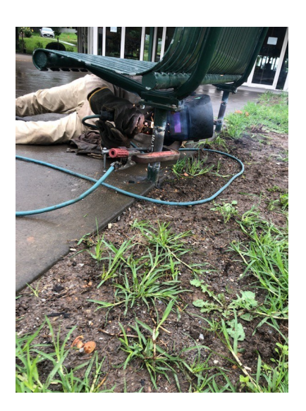
Andrew lifting the height of the seating out the front of the Church.

St Thomas prayers are asked for the following Parishioners: