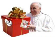
CSOE Response To Evangelii Gaudium