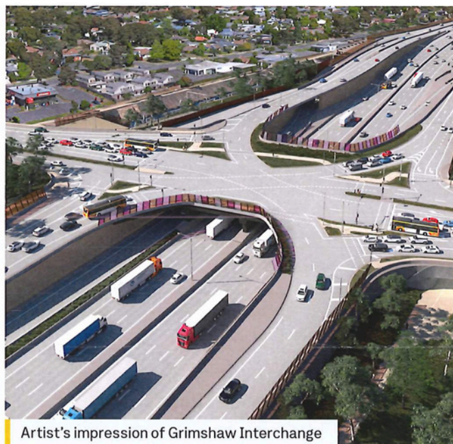
Artist's impression of Grimshaw Interchange

Grimshaw Street will be closed between Greensborough Bypass and Frye Street, for five weeks, with 24 hour works on Grimshaw Street and in Trist Reserve.